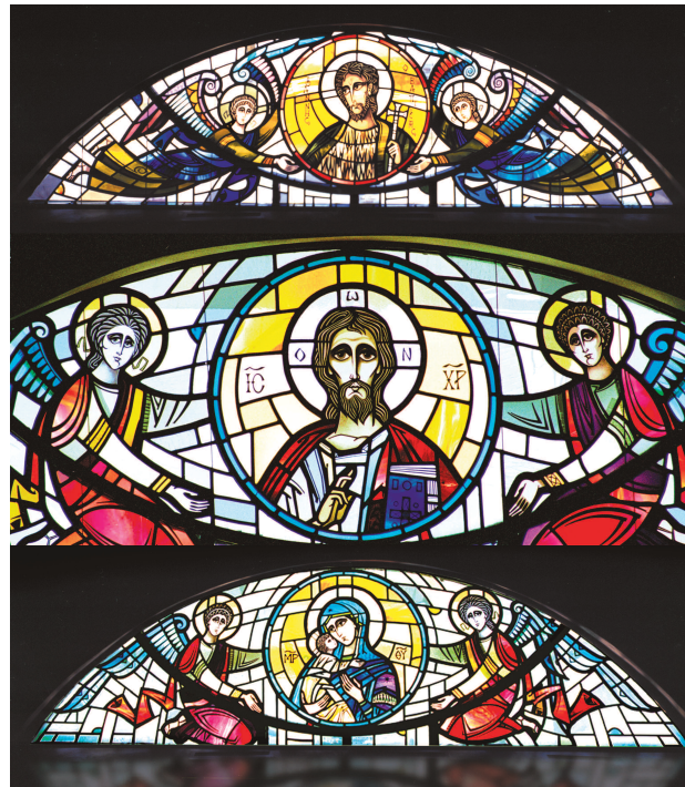
ORIGINAL CSS DESIGNED STAINED GLASS WINDOWS FOR ANNUNCIATION GREEK ORTHODOX CHURCH, WAUWATOSA, WI

The design and fabrication of our new stained glass windows has been entrusted to the Conrad Schmitt Studios, Inc. of New Berlin, Wisconsin, whose award-winning ecclesiastical artistry and craftsmanship have enhanced worship spaces since 1889. The family-owned Studio has been a leader in the Stained Glass Association of America for a century and CSS artists have achieved the honors of Presidency, Fellowship and the Lifetime Achievement Award.