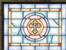
Choir windows 1 - 4